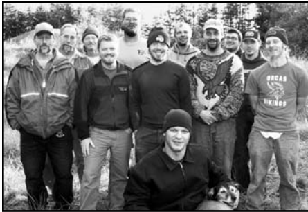
Terra Firma employs 15 crew members, 12 of whom are full-time Orcas residents.